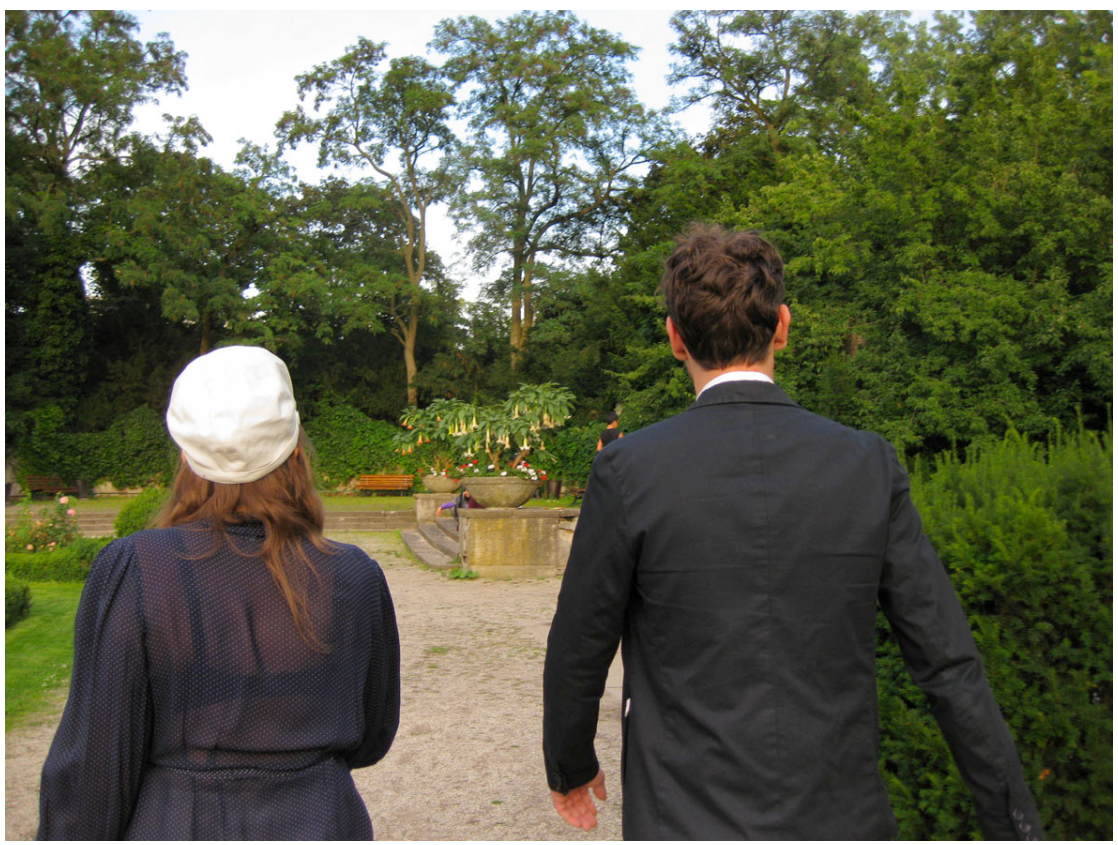
Photograph: Michele di Menna